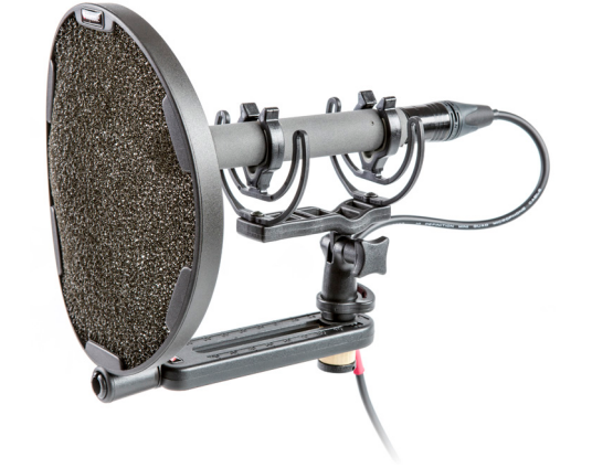
Table Stand & In Vision

The Table Stand is 70mm round, has a non-slip base, and features a 3/8-inch screw thread into which Rycote microphone suspensions, audio recorder suspensions or clips fitted with small-diaphragm or shotgun microphones up to 250mm long may be attached. It is sold separately, or together with a suitable Rycote InVision INV-7 HG MkIII Lyre mount if required. This optional mount holds microphones from 19 to 25mm in diameter, and will securely hold microphones of up to 250mm in length when mounted in the Table Stand.